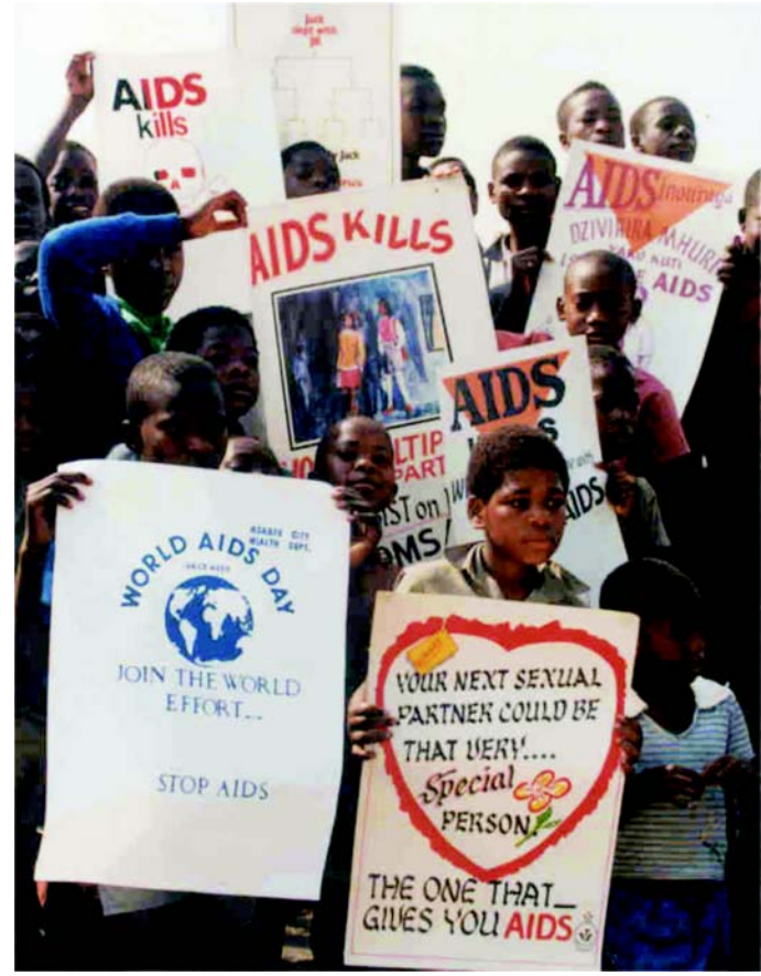
Youth with messages of World AIDS Day